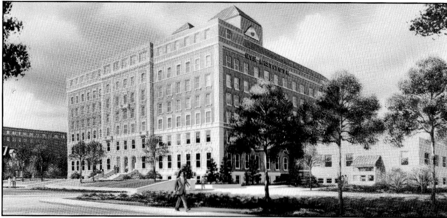
Bethesda Eye Institute will relocate to 1755 S. Grand in June, 1993